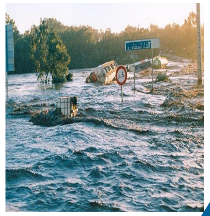
Floods in Mohammedia, 2002

2010 floods interrupted the railway connection between Rabat and Casablanca.