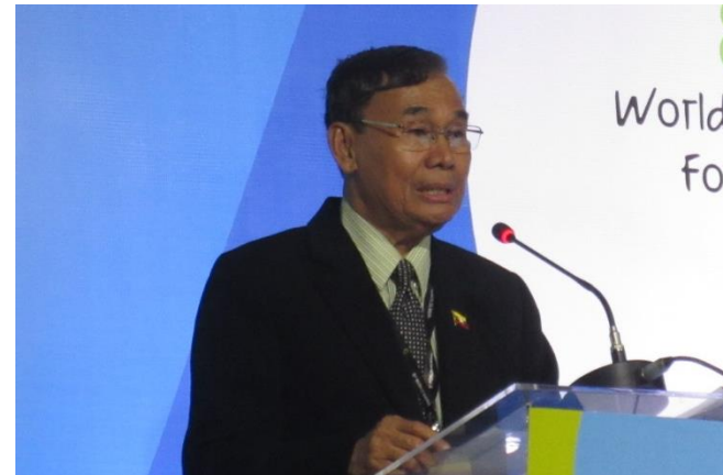
H.E. Mr. Ohn Winn Union Minister of Natural Resources and Environmental Conservation of Myanmar