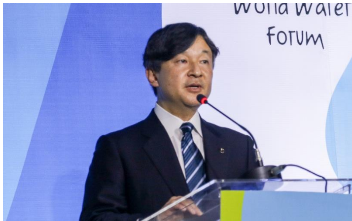
H.I.H. the Crown Prince of Japan