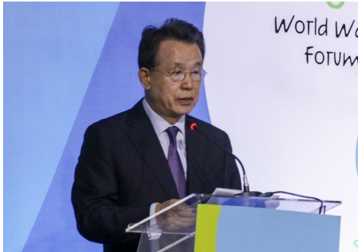
Dr. Han Seung-soo

Chair of the Session, UN Special Envoy for Disaster Risk Reduction and Water, Former Prime Minister of the Republic of Korea