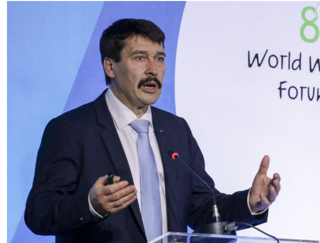
H.E. Mr. János Áder President of Hungary

Chair of the Session, UN Special Envoy for Disaster Risk Reduction and Water, Former Prime Minister of the Republic of Korea