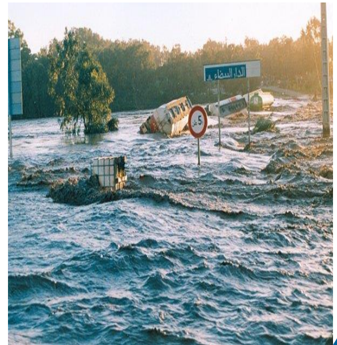
Floods in Mohammedia, 2002